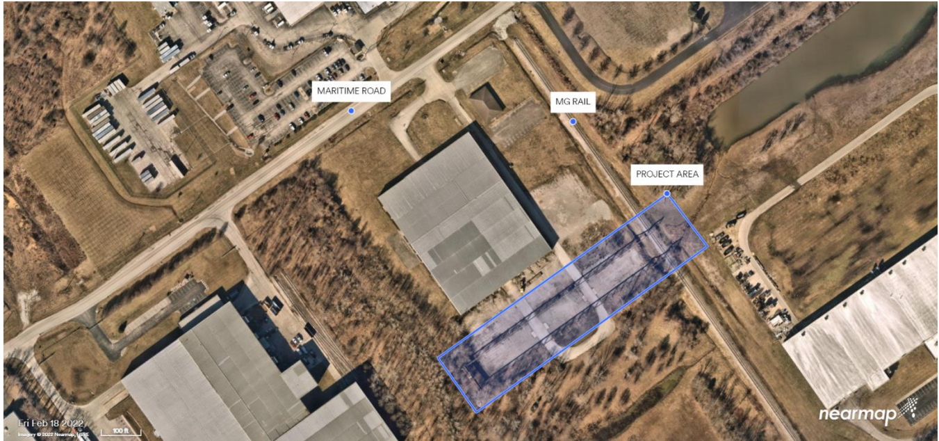
Figure 2 – Approximate Project Limits

D. Details of the crane rail work are shown on Figure 3. Add dimensions are approximate: