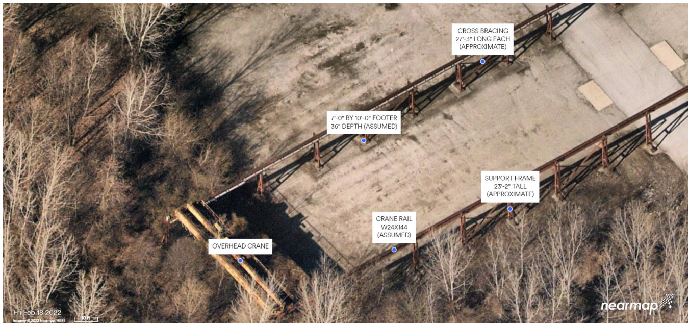
Figure 3 – Details of Crane Rail Work

D. Details of the crane rail work are shown on Figure 3. Add dimensions are approximate: